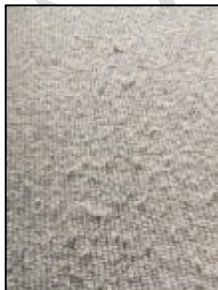
Loop pile carpet Suction only cleaner

Vacuuming a carpet or rug regularly at least 2-3 times per week is strongly advised. Wool & man made carpets or rugs can be vacuumed as soon as they are installed. There are conflicting reports on which type of vacuum is best. Which is best, an upright or cylinder cleaner? A vacuum cleaner with an adjustable rotating brush is best as this will remove deep rooted dust & grit but will also remove any loose fibres. Cut pile carpets can be successfully cleaned with a powerful suction only cleaner but loop pile carpets can shed fibres that cling to the loops and need the additional adjustable rotating brush usually only found on upright cleaners.